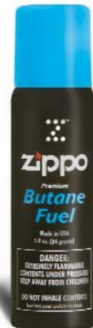
3801 1.9 oz (54 gram) BUTANE GAS