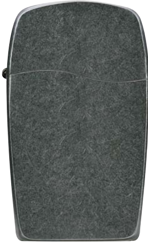
30004 SHADOW Zippo's newest basic black solid brass lighter is media finished, then plated with dark chrome.