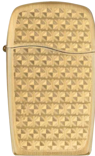
30033 GOLDEN HOLOGRAM Sophisticated Vertical Gold lighter shimmers with jewel cut holographic diamond patterns.