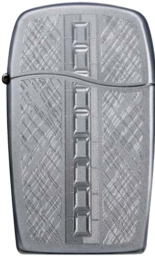
30030 ZIPPED Dusted Chrome is embellished with an etched background highlighted by a diamond carved herringbone accent.