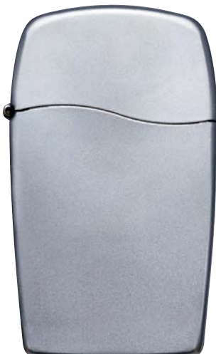
30027 DUSTED CHROME Bead-blasted brass lighter, chrome plated. A dazzling new look.