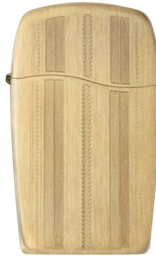
30005 GOLD TUXEDO 18-karat gold plate lighter with diamond carved scallops and alternating herringbone bands.