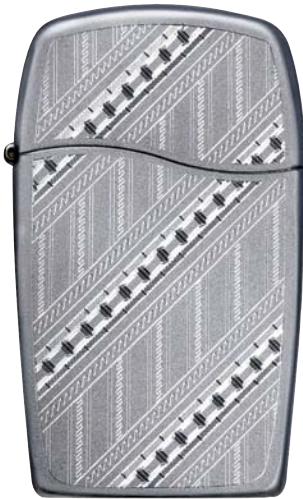
30029 CHROME PATHWAYS Dusted Chrome lighter sparkles with an elegant diamond carved diagonal bracelet pattern contrasted with vertical scallops.