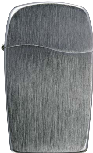
30001 VERTICAL CHROME Brushed chrome hand buffed to a satin sheen. Each lighter is a unique and beautiful work of art.