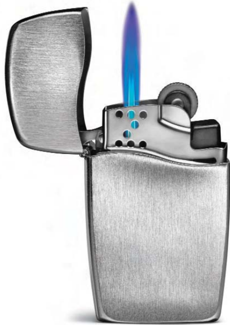
• NEW ZIPPO BLU™ LIGHTER, BUTANE GAS FUEL