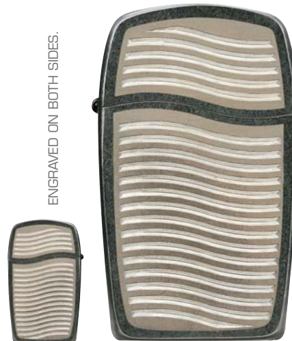
30032 CHANNELED Laser and rotary engraved diamond drawn fill patterns accentuate the sweeping curve of the lid line. New Shadow finish.