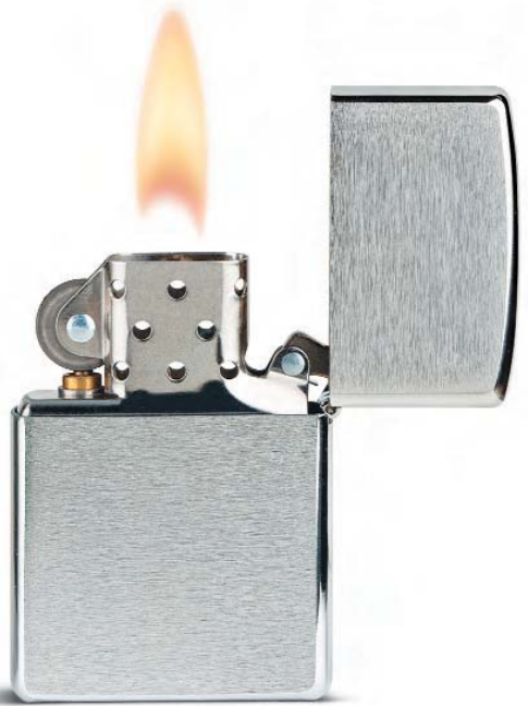
• ORIGINAL ZIPPO LIGHTER, LIQUID FUEL