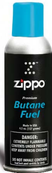
3800 4.5 oz (127 gram) BUTANE GAS