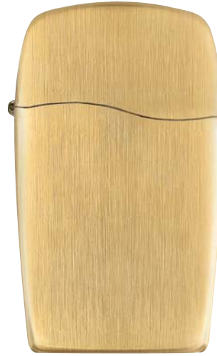
30002 VERTICAL GOLD Burnished 18-karat gold plate. Hand buffing makes each lighter unique.