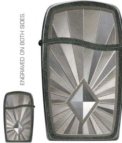
30031 MESMERIZED Shadow lighter with a diamond drawn starburst. Rotary and laser engraved on dark chrome.