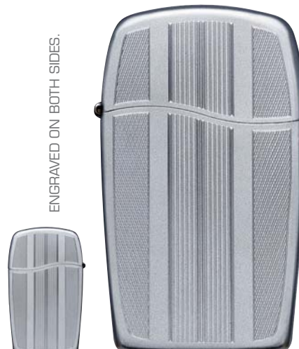
30028 CHROME TUXEDO Dusted Chrome lighter with a diamond carved knurled edge and polished vertical bands.