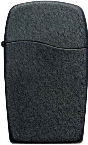
30013 SABLE Rich, textured black finish enhances the tactile appeal of this understated lighter.